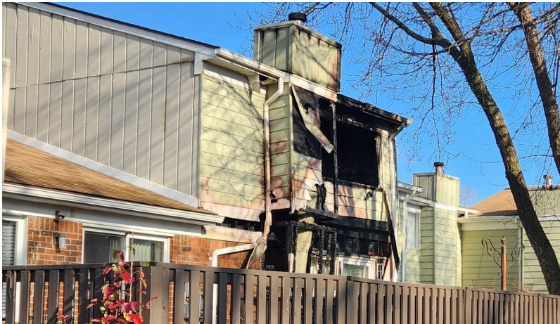
Wickham unit fire from December 2023

Co owners and residents are reminded to follow safety procedures on Coventry premises.